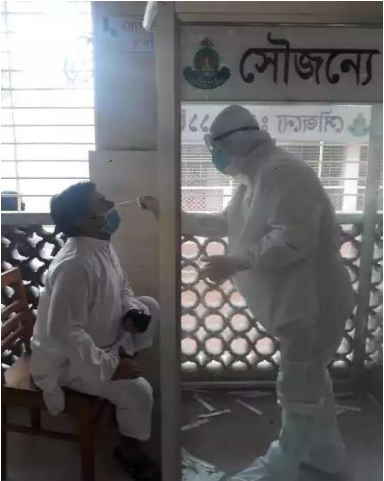
12. Sample collection in a wrong way through in a medical college hospital