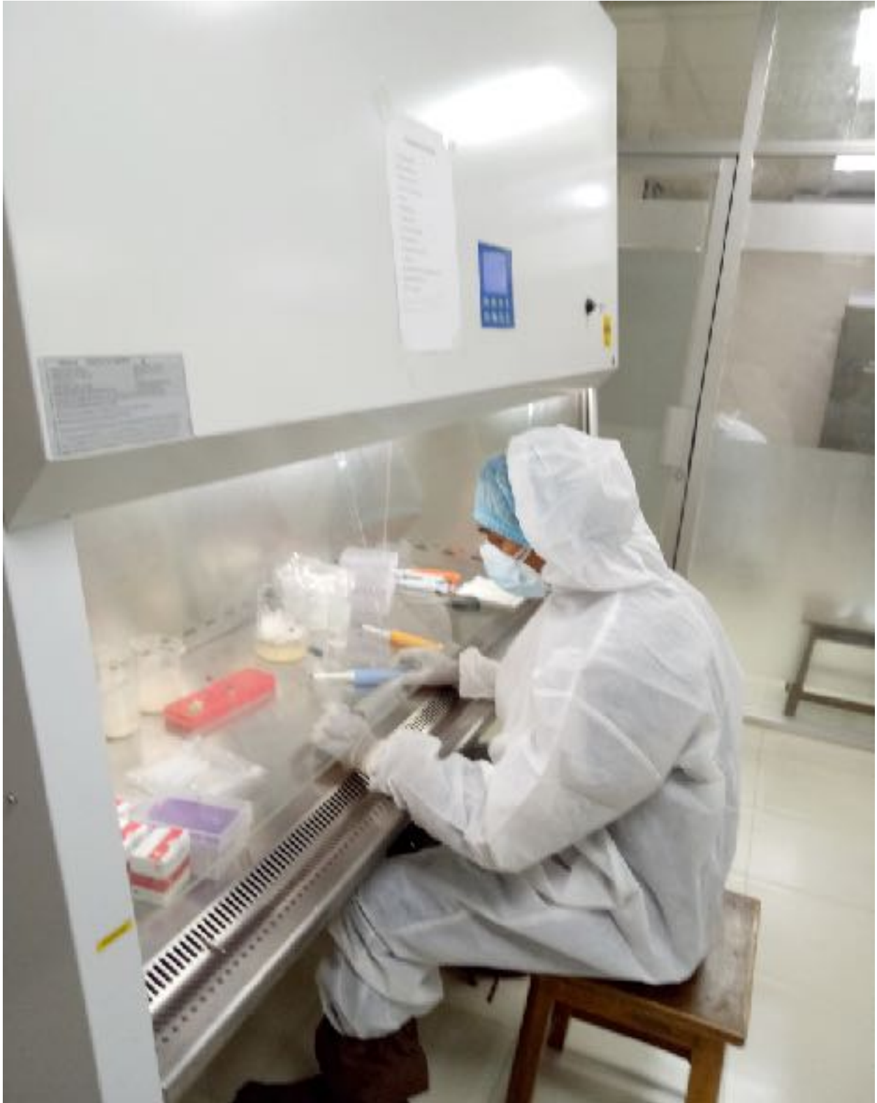
13. PCR Laboratory staff not wearing PPE adequately