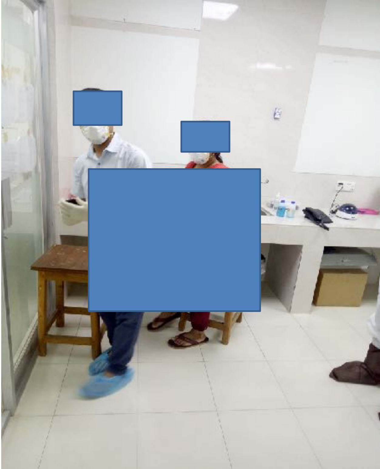
14. A wash room staff without adequate PPE and with too many paraphernalia