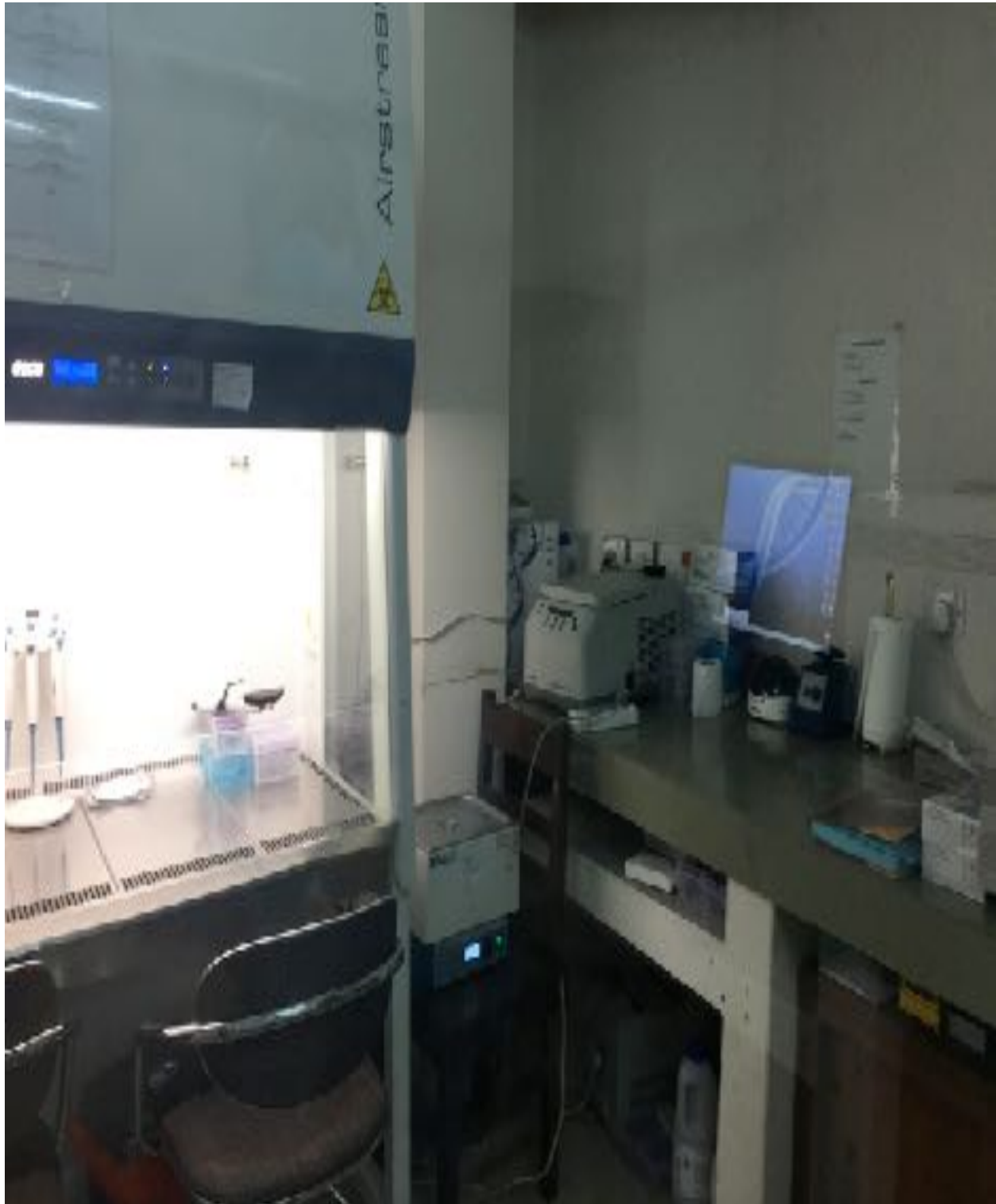
19. A sample reader and recorder in a PCR Laboratory