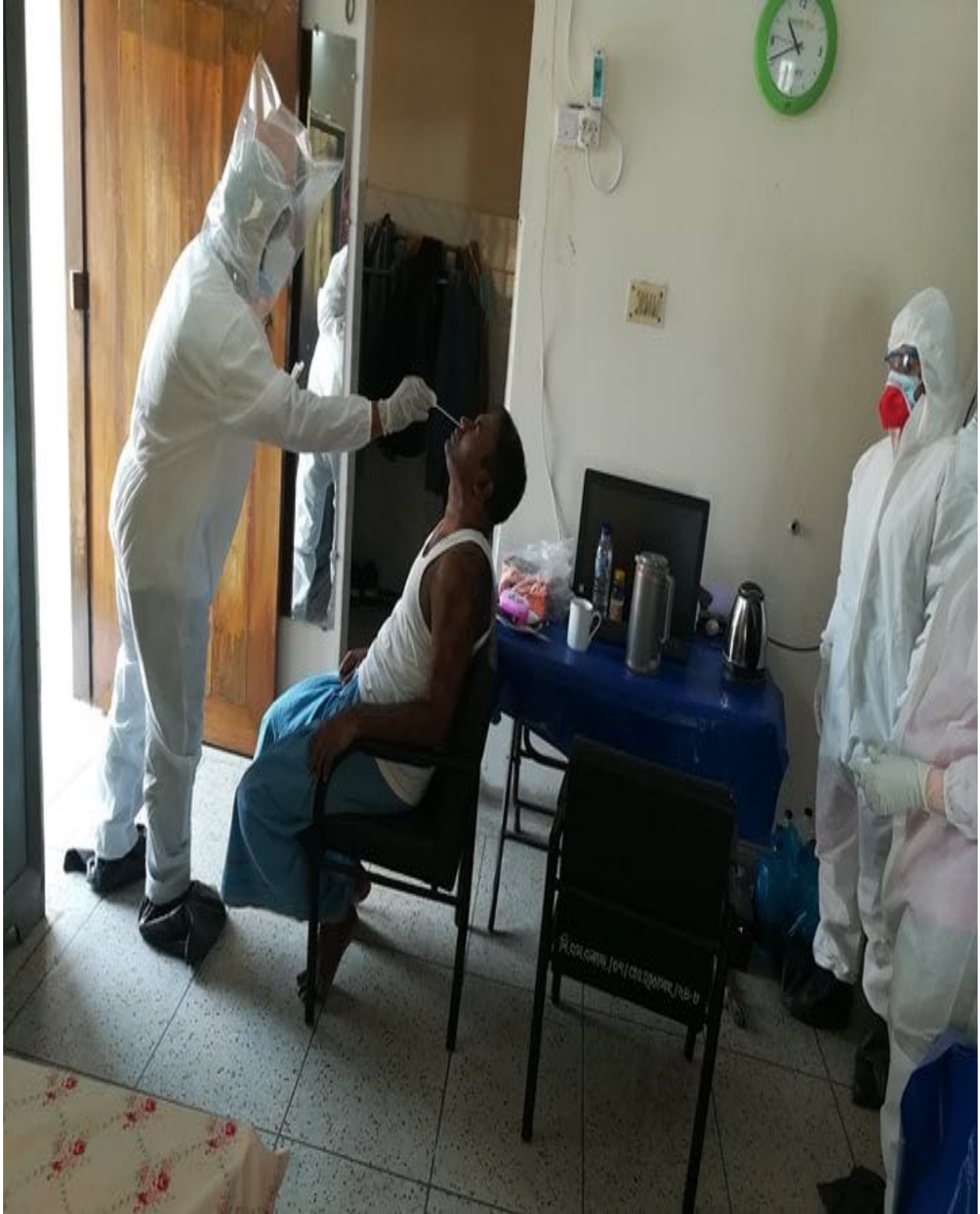
10. Sample collection in a wrong way in an upazila health complex of Chattagram