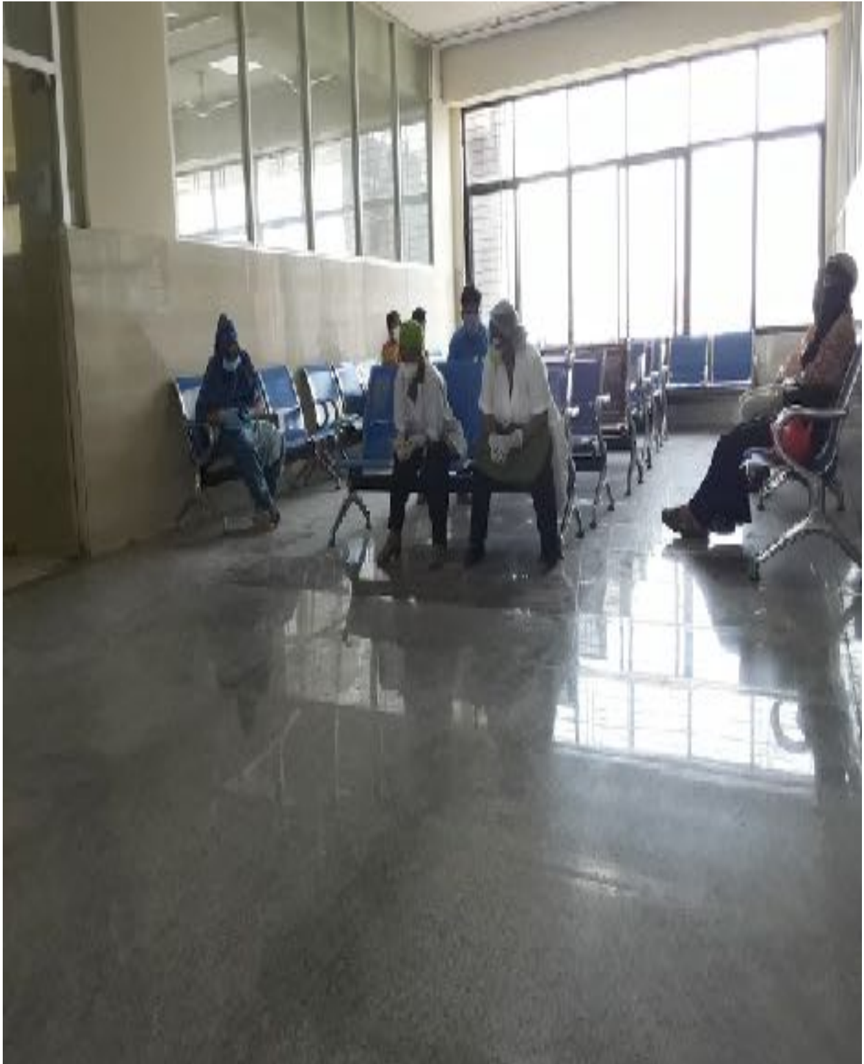
6. Washing hand with antiseptic after collecting sample