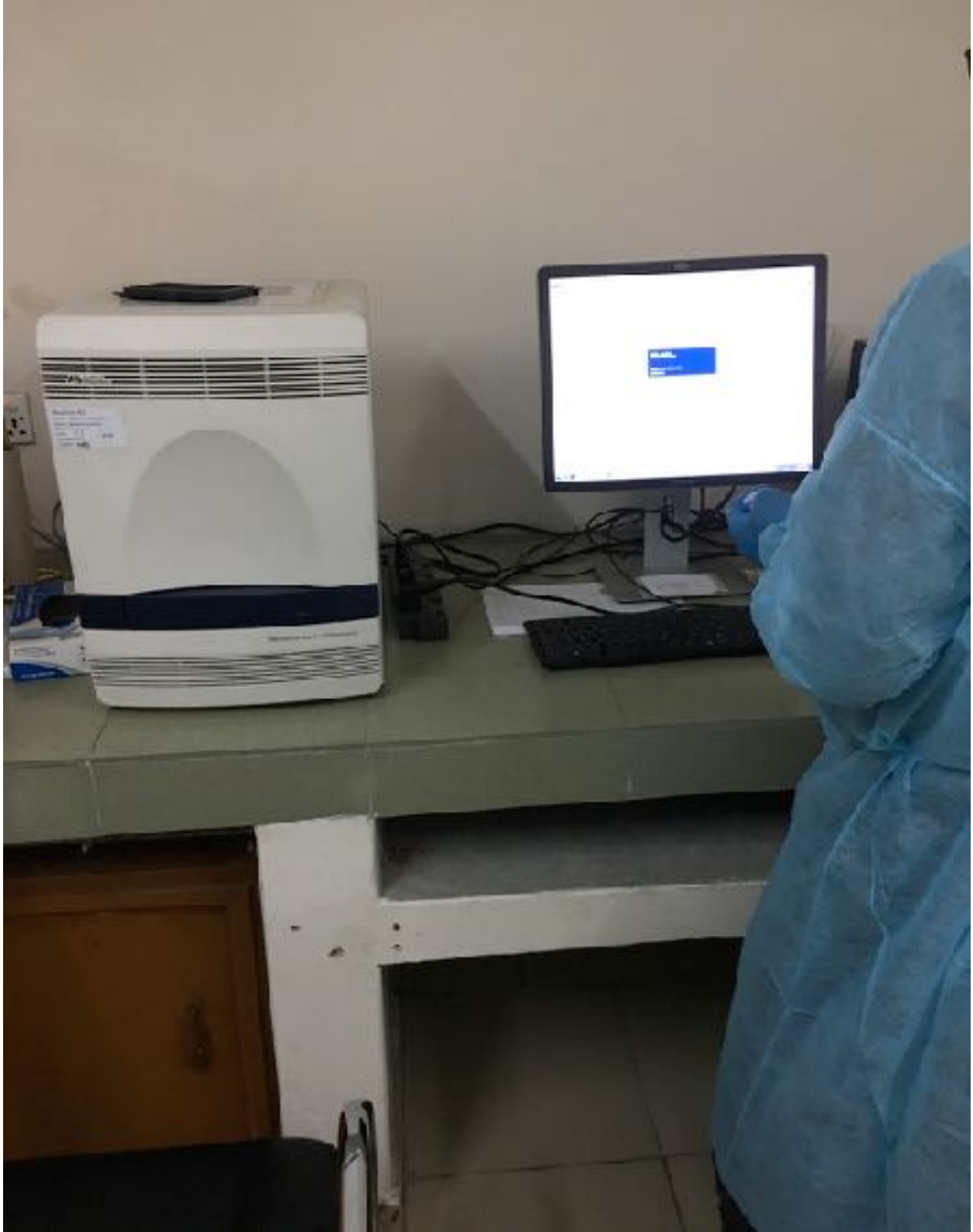
20. A recorder of test result