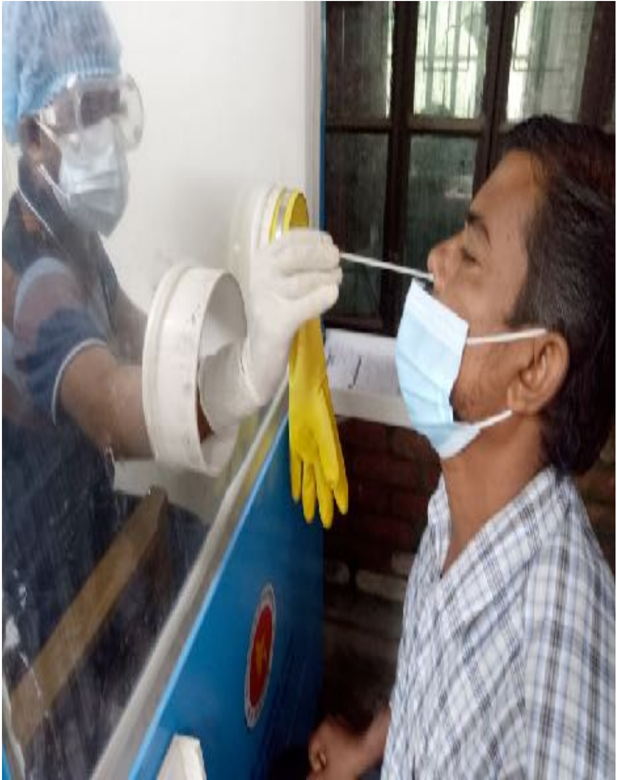
13. A PCR laboratory (BSL-2) Cumilla