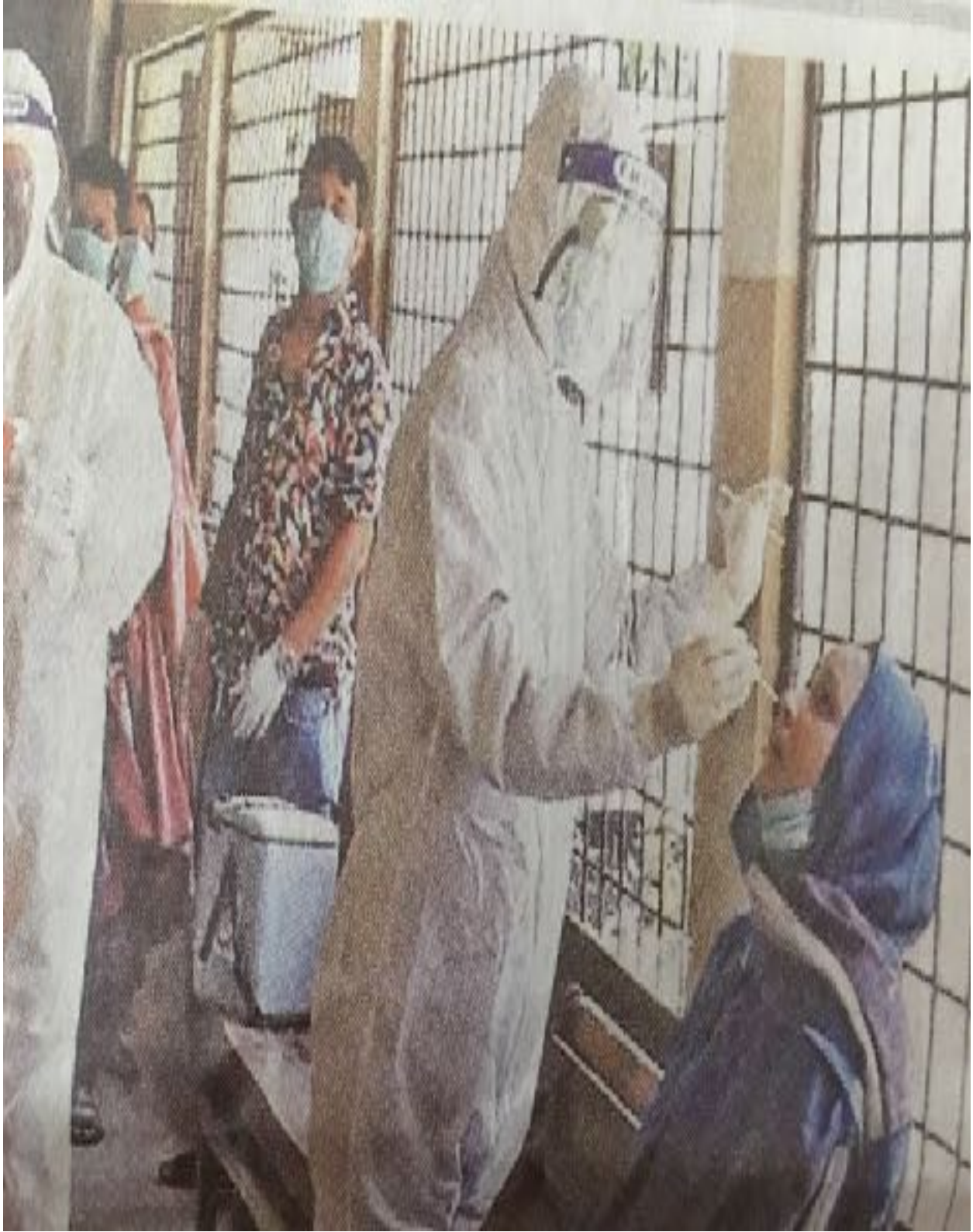
11. Sample collection in a wrong way in a district hospital